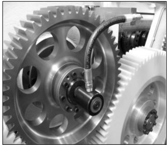
Superseded Rotary Union: 2394605B Replacement Rotary Union: TB3400-010#01

The regulated air pressure to the lubrication pumps must be limited to 3 BAR (43 PSI). This is referenced in TB3400-09.