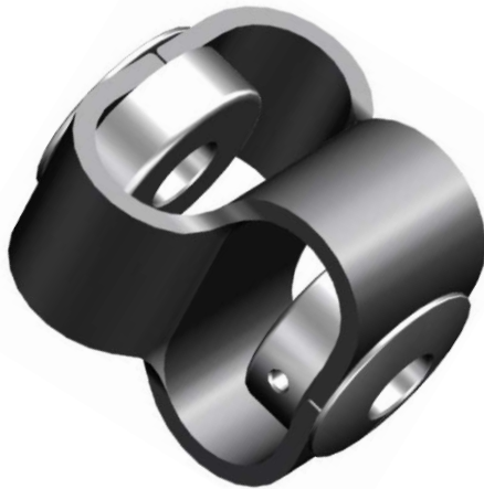
Fig 1. Double loop coupling